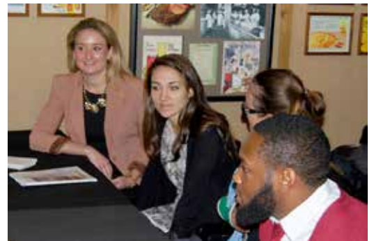
Prospective students at luncheon near Times Square in their honor during Clinical Conference. Interested students braved snow and chill to attend.

NY15 is now history. The New York College of Podiatric Medicine (NYCPM) was well represented at the 2015 New York Podiatric Clinical Conference on January 23-25 at the Marriott Marquis Hotel in New York City, by a popular booth; a jam-packed, lively reception for alumni; a plethora of speakers, and a well-attended alumni meeting.