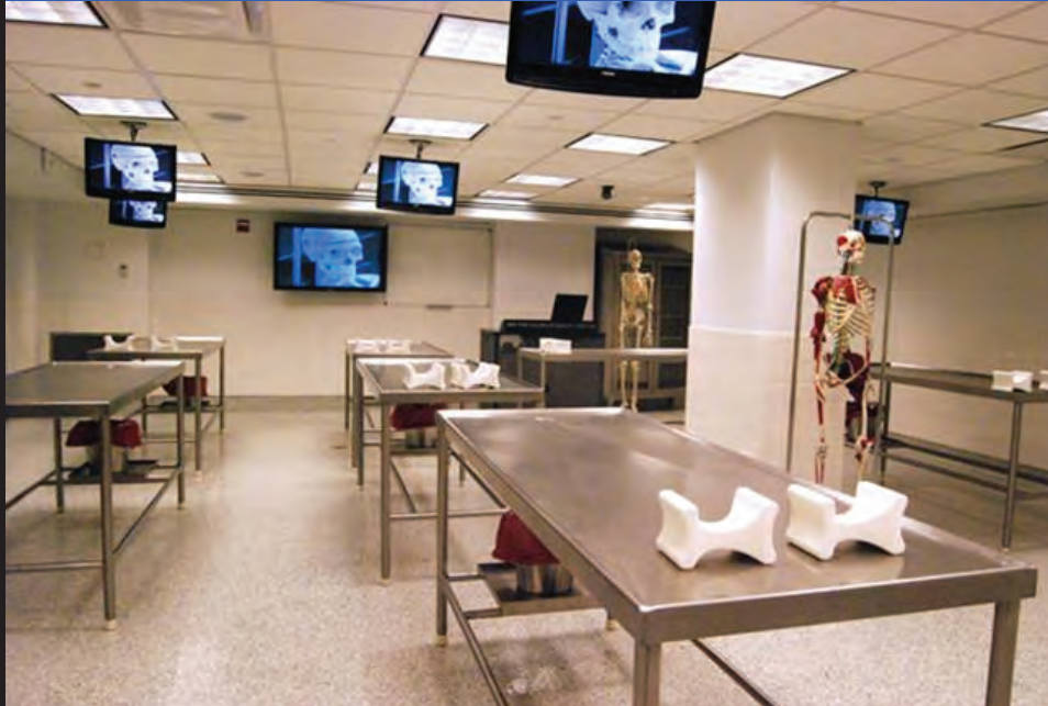
The new Bako Anatomy Lab at NYCPM.