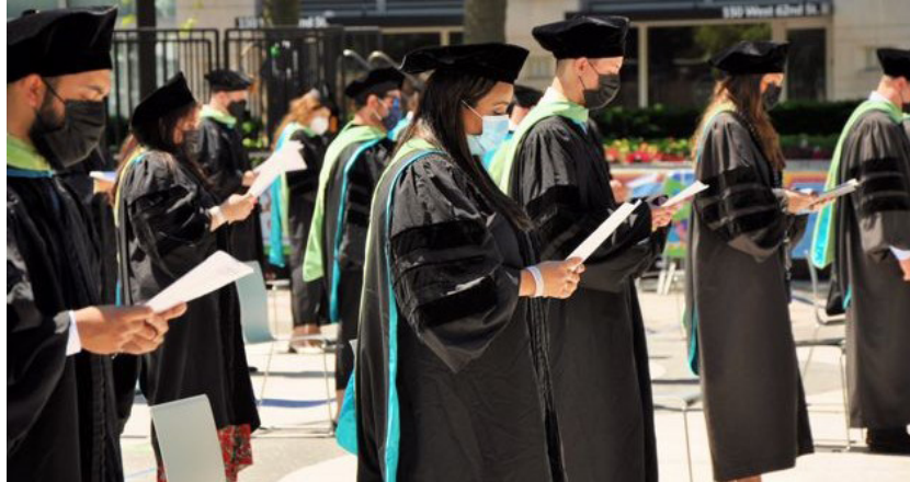
Newly minted DPMs recite the Hippocratic Oath for the first time.