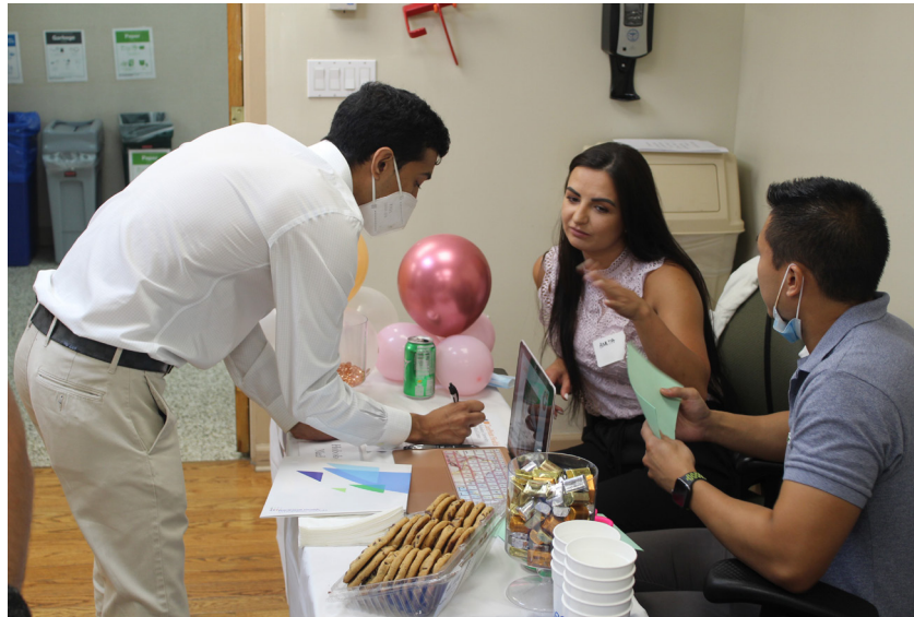
Information (and goodies) were dispensed at the Residency Fair.

On Friday July 22nd, NYCPM hosted a live Residency Fair, organized by Student Services: the first time in three years that the Fair was able to go live. Representatives from dozens of residency programs set up exhibits and literature that displayed their offerings. Tables filled the Bruce Frankel conference room, classrooms, and lined hallways; 2023 students crowded around them, eager for information. At each table, residents – some of them NYCPM graduates! – were the sources of both information and on-the-ground experience.