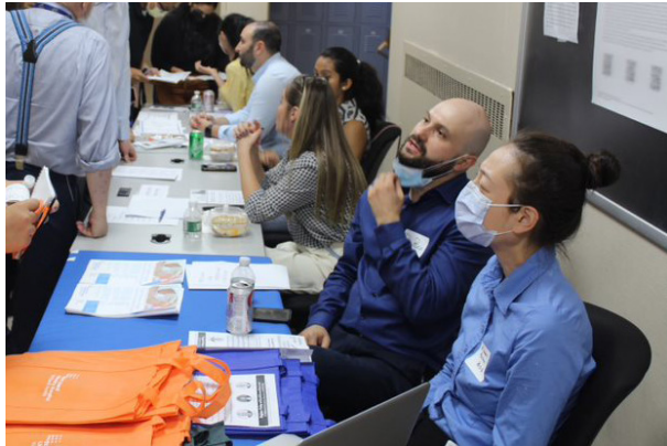
Loads of information and advice on hand in second-floor hallway . . .