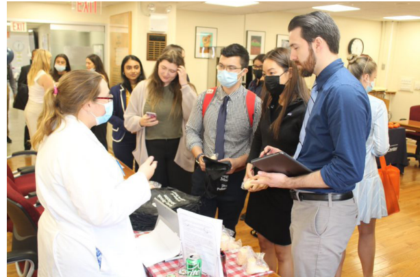
. . . and in Bruce Frankel Conference Center.