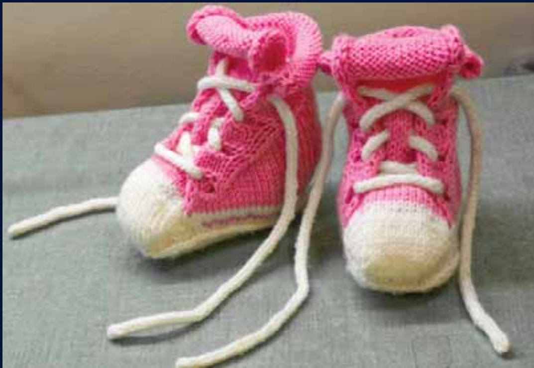
"Baby Girl Pink Converses"