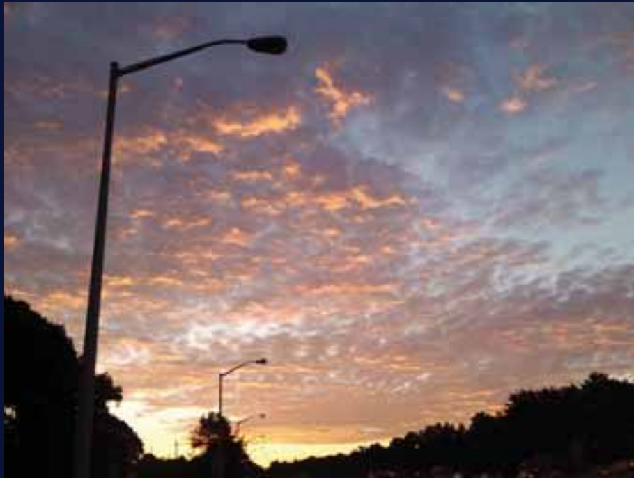
"Sunrise on the Staten Island Expressway"