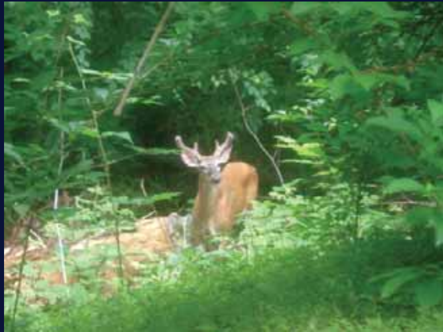
"Antlered Deer are Rare During Hunting Season"