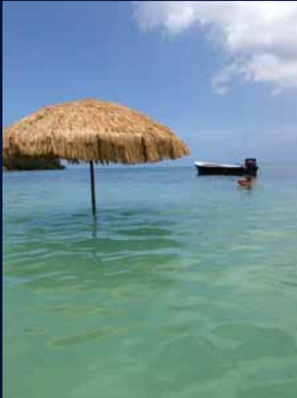
"Sky in Puerto Rico"