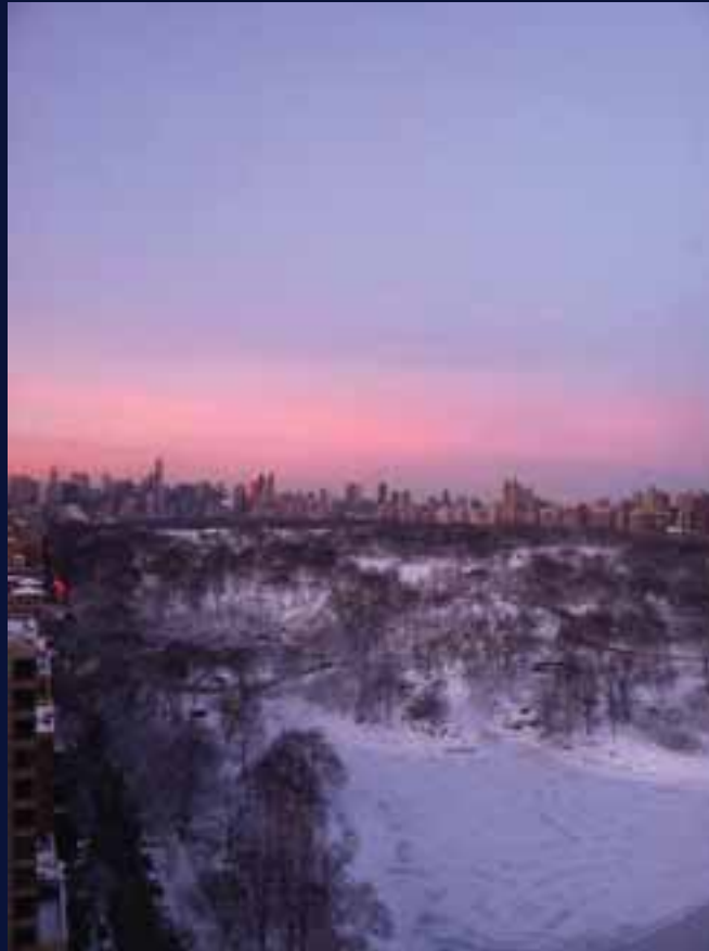
"Pink Sunrise from the Apartment"