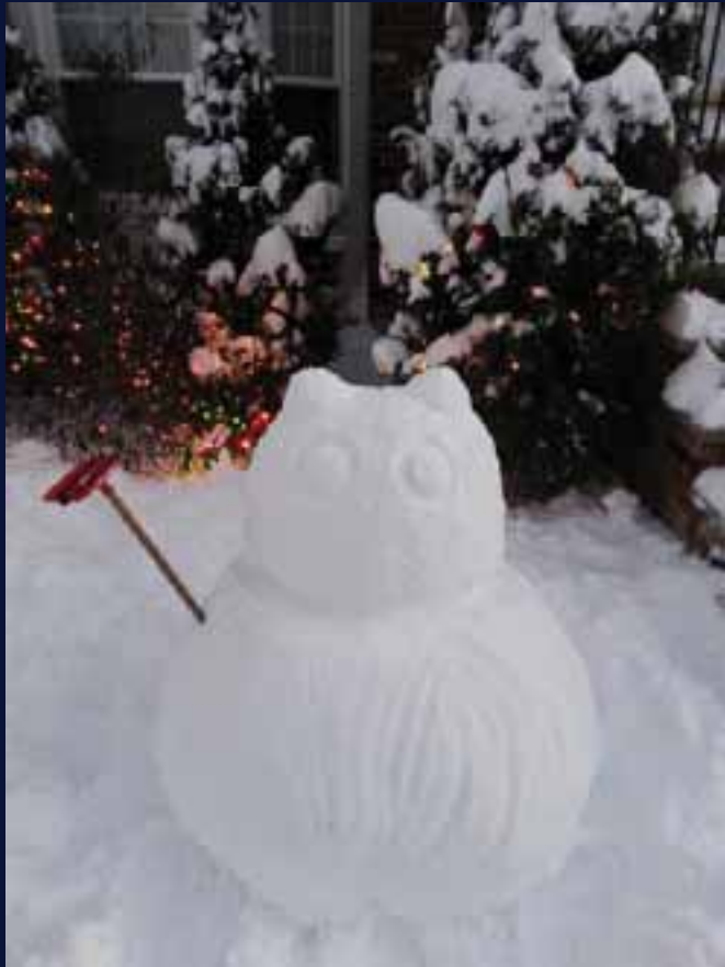
"First snow creation"