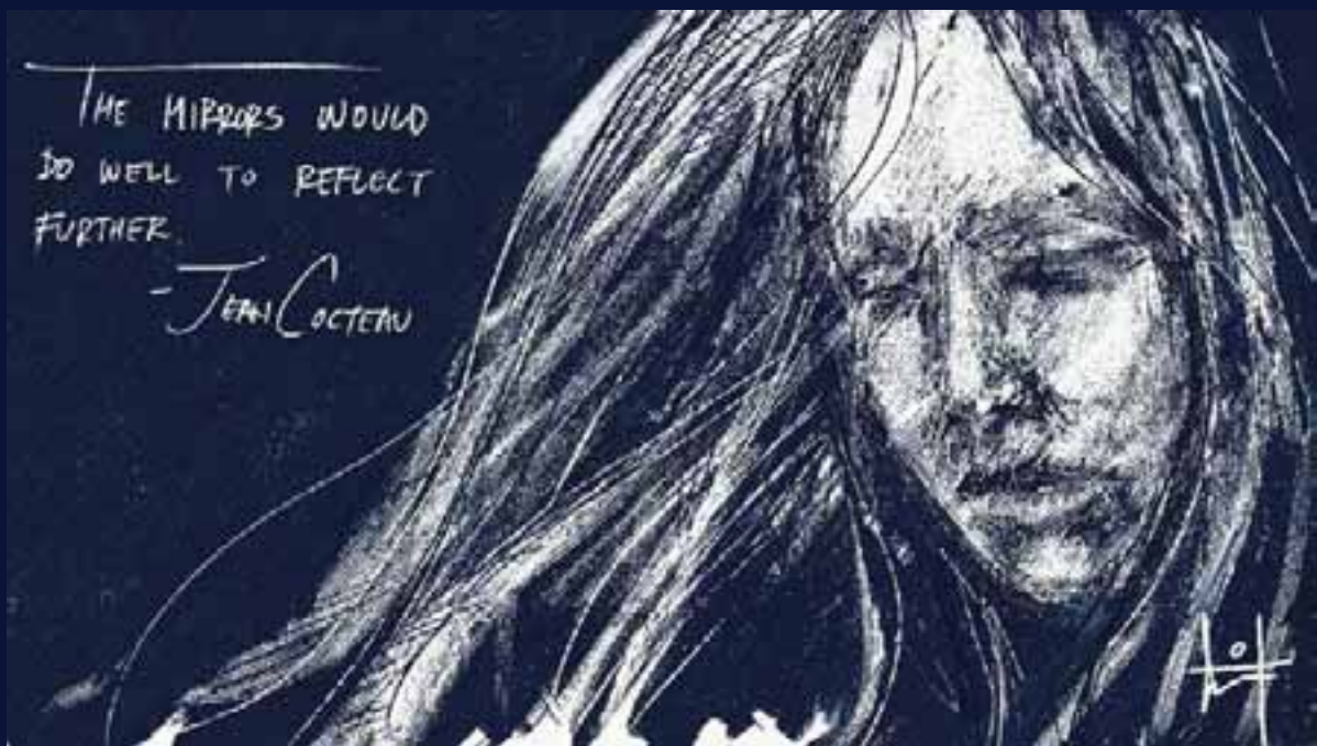
"With Each New Step"