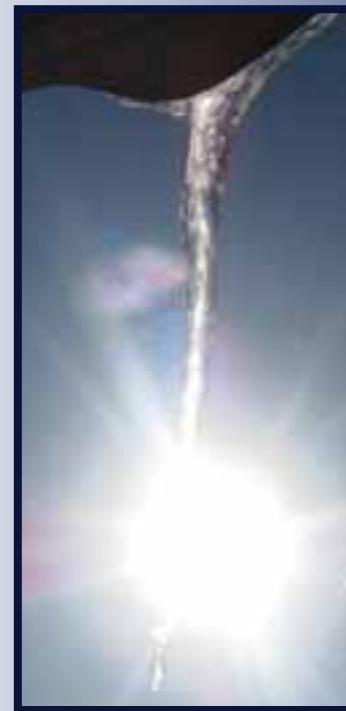
"Sunny Icicle New York City"