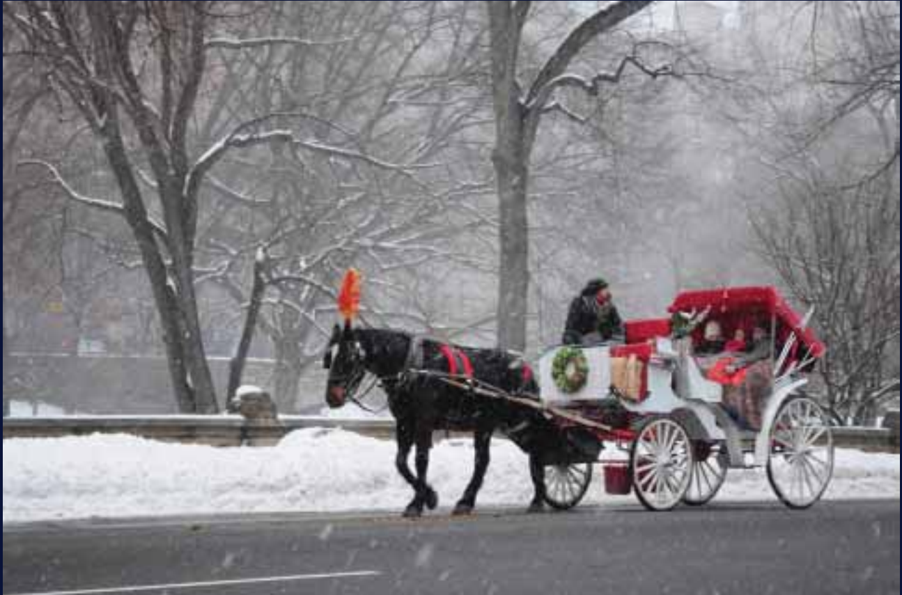
"A ride through Central Park"