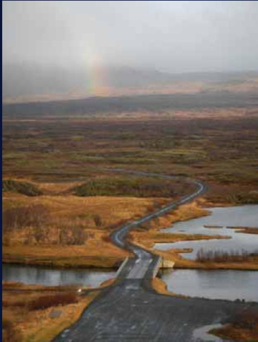
"Road to Rainbows"