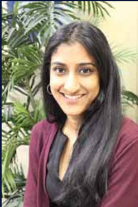
Editor-in-Chief: Prema S. Hampapur