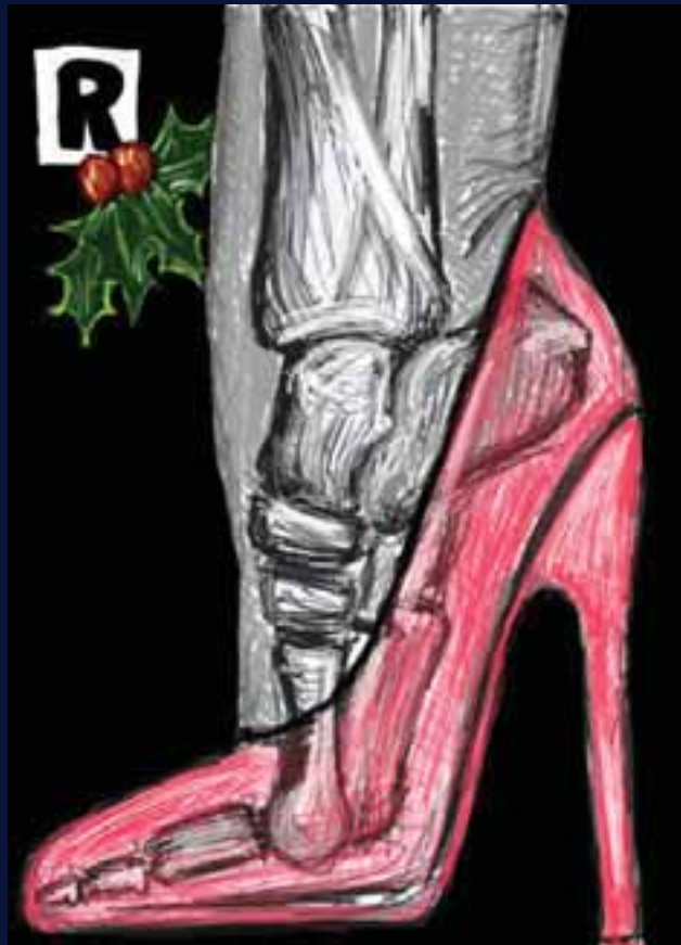
"A Holiday Ray"