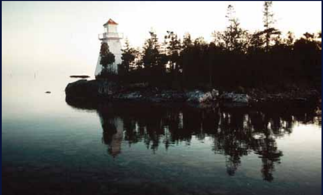
"Lighthouse South of Manitoulin Island, 1993"